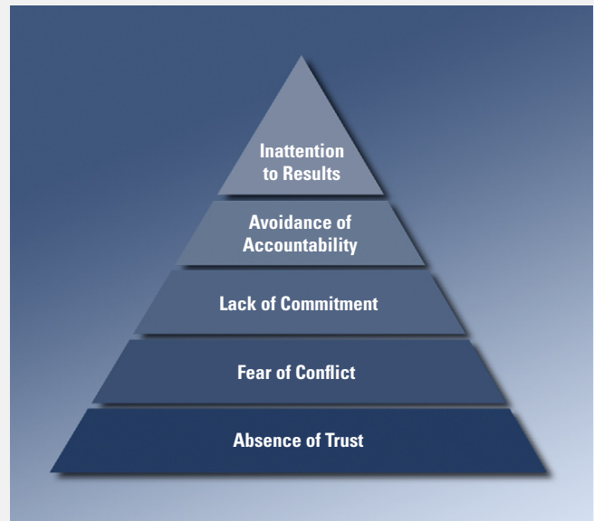
The Five Dysfunctions of a Team by Patrick Lencioni

Outcome: The team will make substantial progress toward becoming more cohesive – improving trust and their ability to engage in unfiltered, productive conflict. This will result in the team ultimately making better, faster decisions and eliminating any lingering politics that may exist. Additionally, the team will resolve any structural challenges that may inhibit the group's ability to work together. Team members will walk away with a clear sense for what they can do differently – both behaviorally and operationally – that will have meaningful impact on the team's ability to succeed.